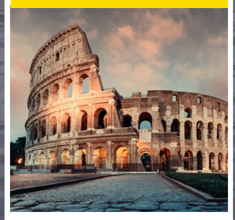
8 DAY ITINERARY Rome > Naples > Sorrento

ROME, NAPLES & SORRENTO WITH EXCLUSIVE VATICAN EXPERIENCE