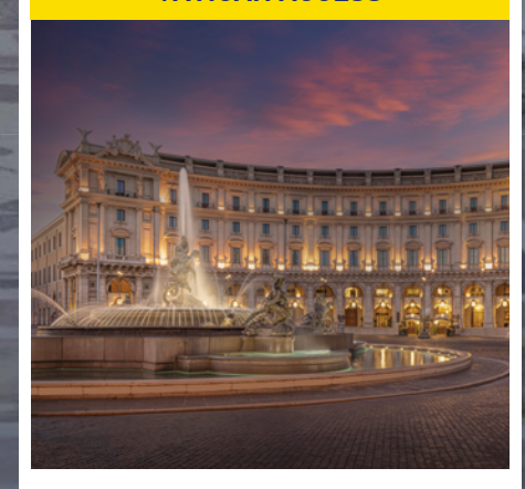
8 DAY ITINERARY Venice > Florence > Rome

VENICE, FLORENCE & ROME WITH AFTER-HOURS VATICAN ACCESS